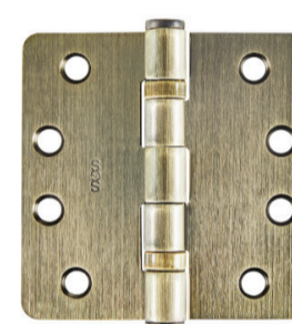
US5 Antique Brass (Self-Closing Option Available as Special Order.)