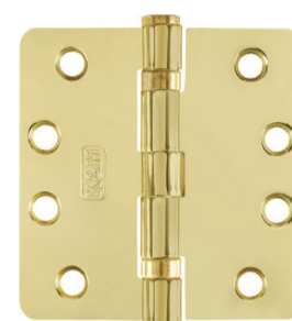
US3 Brass (Non-Ferrous or *Self-Closing Options Also Available)