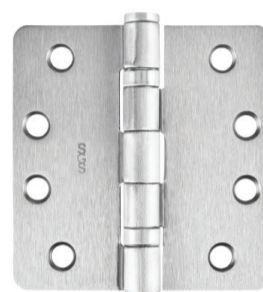
US26D Brushed Chrome (*Self-Closing Option Also Available)