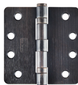
US10B Bronze (Non-Ferrous or *Self-Closing Options Also Available)