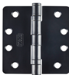
US1D Black (Non-Ferrous or *Self-Closing Options Also Available)