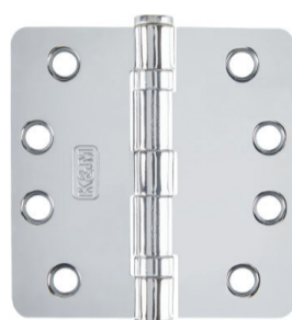
US26 Bright Chrome (*Self-Closing Option Also Available)