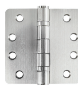
US32D Stainless Steel (Non-Ferrous)

*Self-Closing Hinges ARE NOT Ball Bearing.