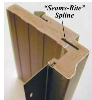
(Vinyl nailing flange is optional.)

Exclusive to WeatherGuard is our patented "Seams-Rite" spline that enables the brick-mould to be applied to the jamb without using nails. Besides eliminating nail holes, "Seams-Rite" ensures a continuous water barrier. An optional vinyl nailing flange is also available.